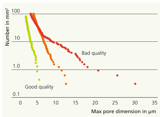
Figure 2: Area-based pore size distribution of three different batches of \text{Si}_3\text{N}_4 rolling elements.